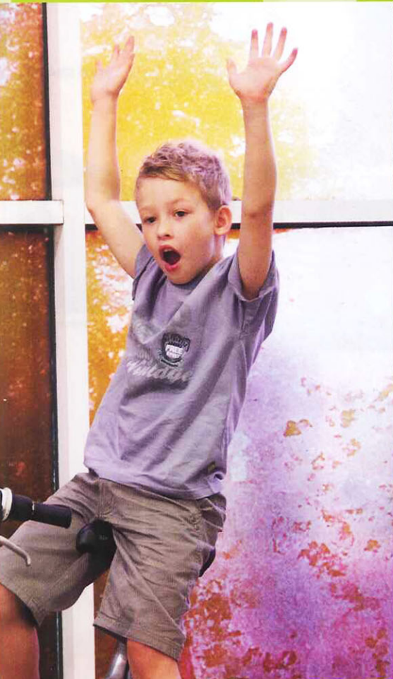
Basic tees and checked shirts with colours of nature are designed to be paired and go along well with cargo shorts and jeans.