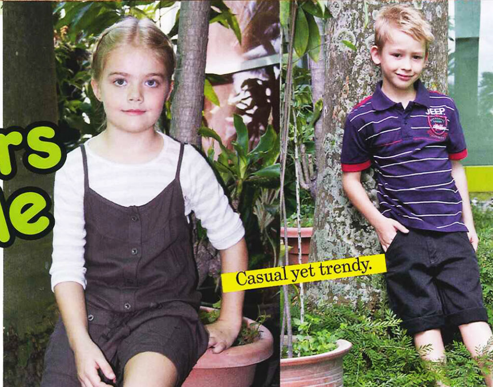
Casual yet trendy.