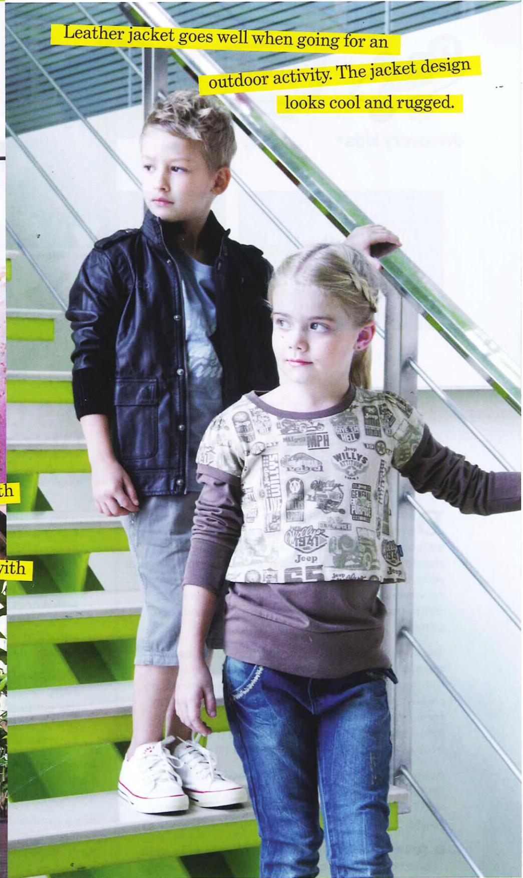
Leather jacket goes well when going for an outdoor activity. The jacket design looks cool and rugged.