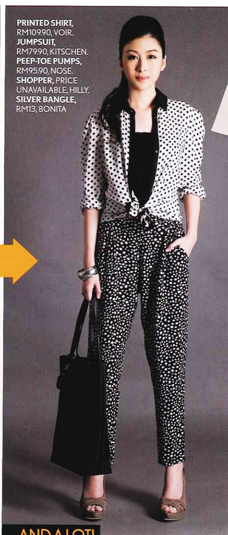
PRINTED SHIRT, RM10990, VOIR. JUMPSUIT, RM7990, KITSCHEN. PEEP-TOE PUMPS, RM9590, NOSE SHOPPER, PRICE UNAVAILABLE, HILLY. SILVER BANGLE, RM13, BONITA