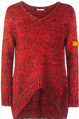
PULLOVER WITH ASYMMETRICAL HEMLINE, H&M