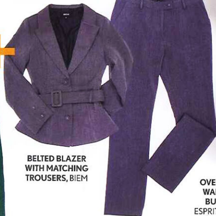
BELTED BLAZER WITH MATCHING TROUSERS, BIEM