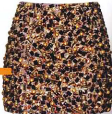
SEQUINED SKIRT, H&M