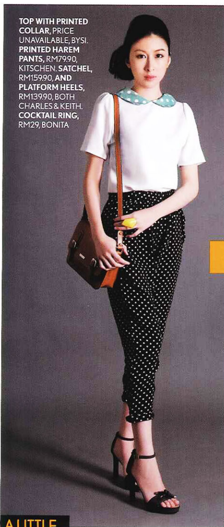
TOP WITH PRINTED COLLAR, PRICE UNAVAILABLE, BYSI. PRINTED HAREM PANTS, RM7990, KITSCHEN. SATCHEL, RM15990, AND PLATFORM HEELS, RM13990, BOTH CHARLES & KEITH. COCKTAIL RING, RM29, BONITA

Inspired by the highly-raved-about Yayoi Kusama collection for Louis Vuitton, we experiment with this tricky trend in two intensities.