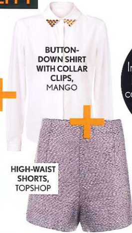
BUTTON-DOWN SHIRT WITH COLLAR CLIPS, MANGO