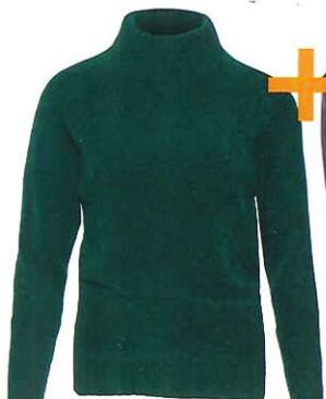
TURTLENECK PULLOVER, H&M