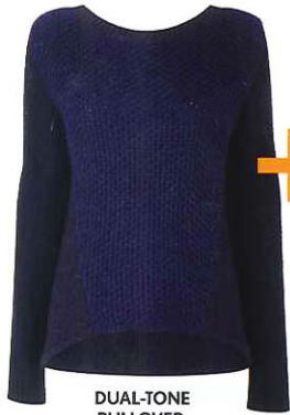
DUAL-TONE PULLOVER, DOROTHY PERKINS