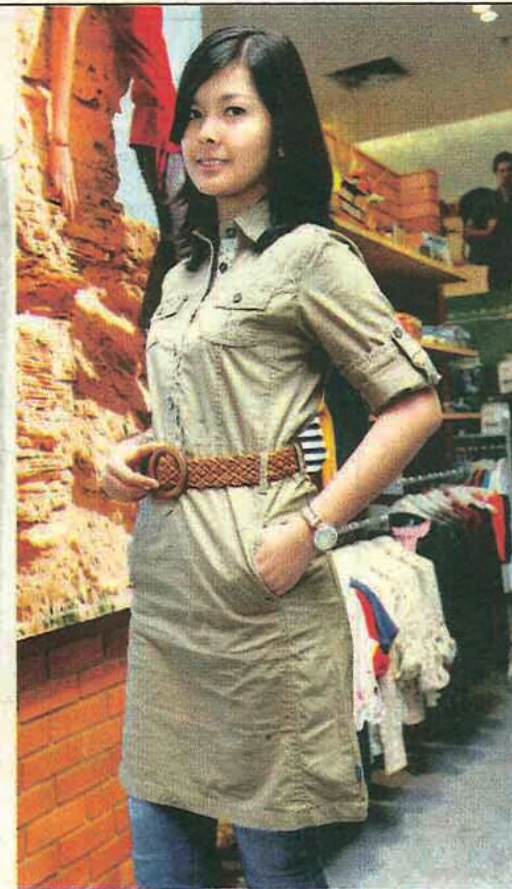
Dress for casual wear