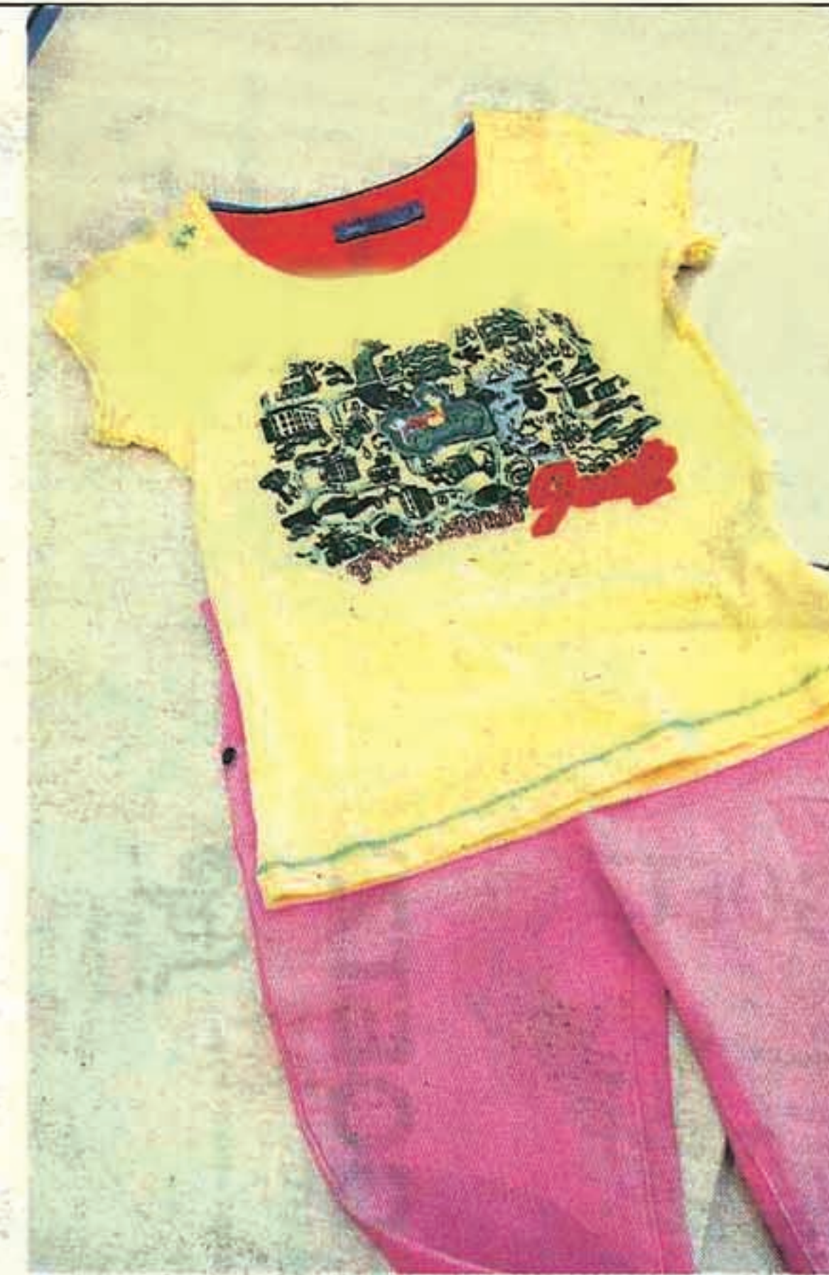
Adorable yellow baby T-shirt