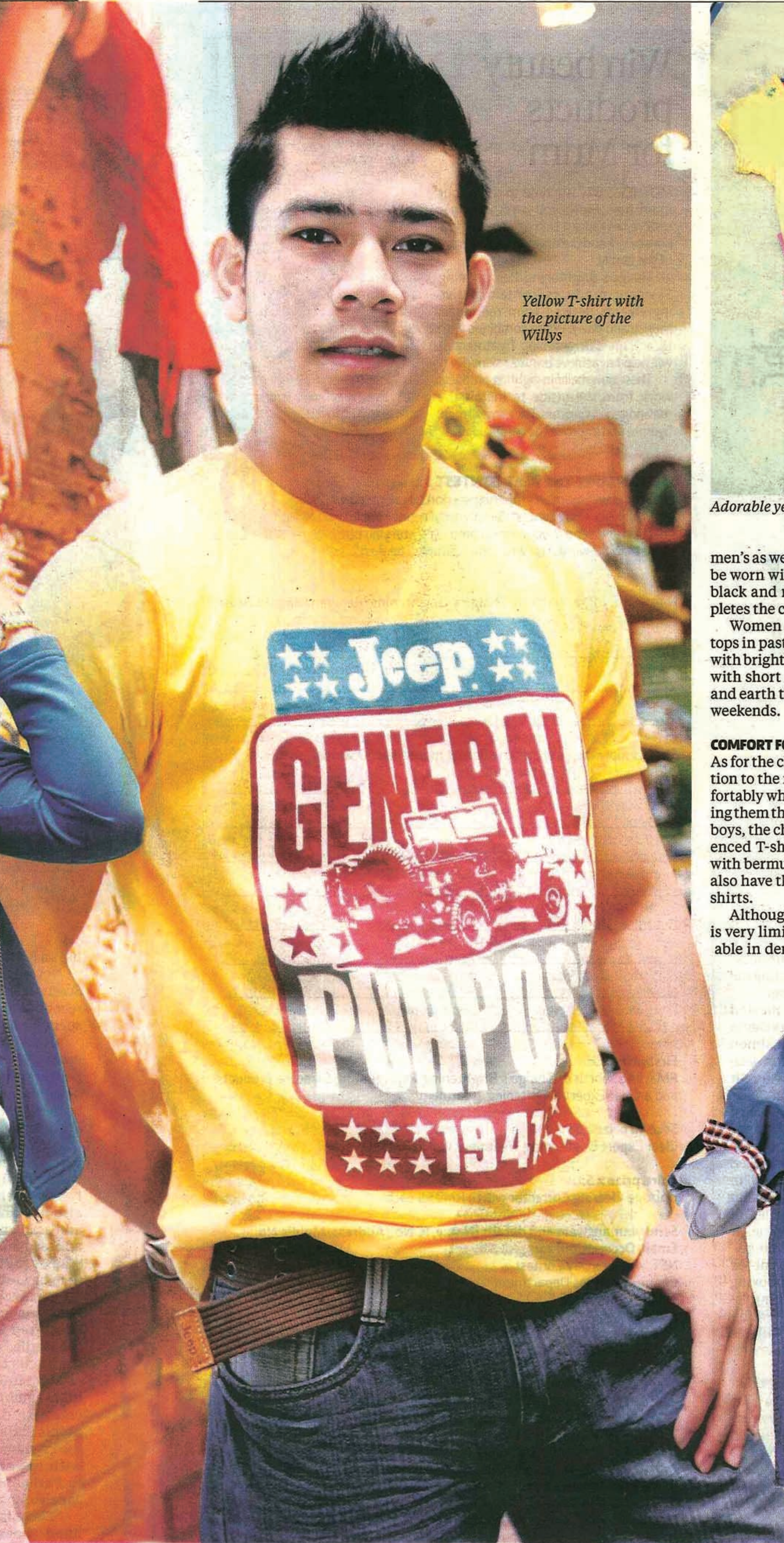
Yellow T-shirt with the picture of the Willys