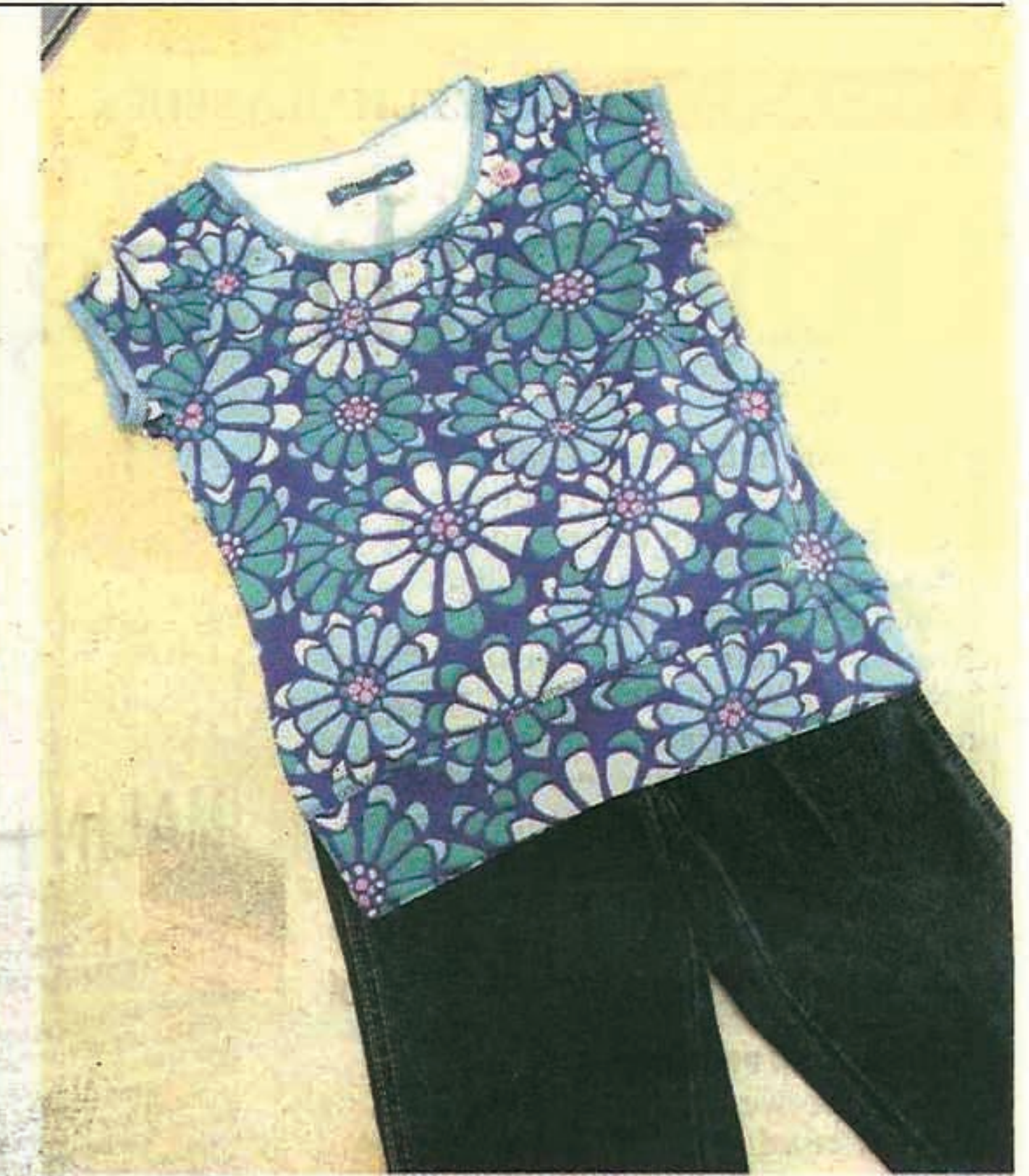
T-shirt with floral motif

men's as well as chequered shirts, to be worn with cut-offs in khaki. The black and red striped hoodie completes the casual look.