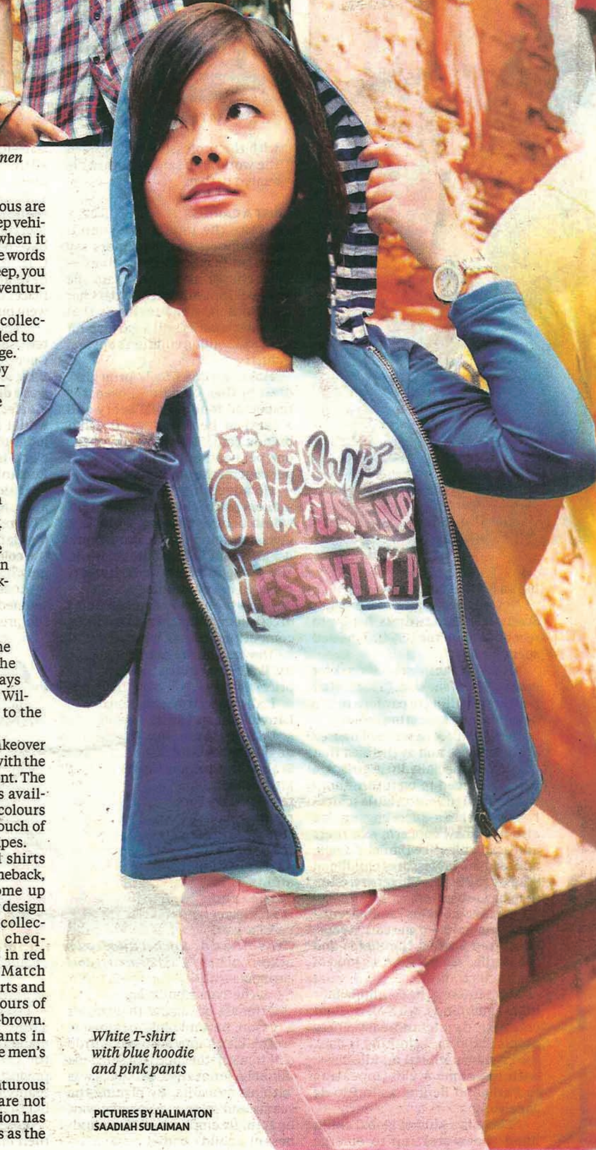
White T-shirt with blue hoodie and pink pants

While rugged and adventurous may suit men, the women are not forgotten. The women's section has T-shirts with similar designs as the