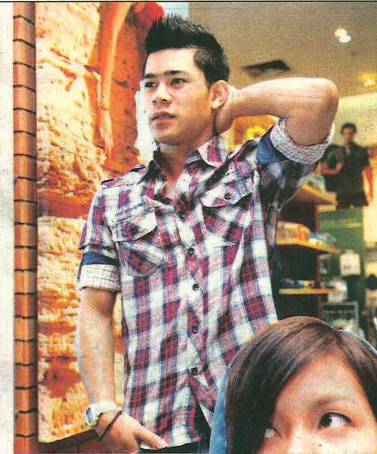
Plaid shirt for men