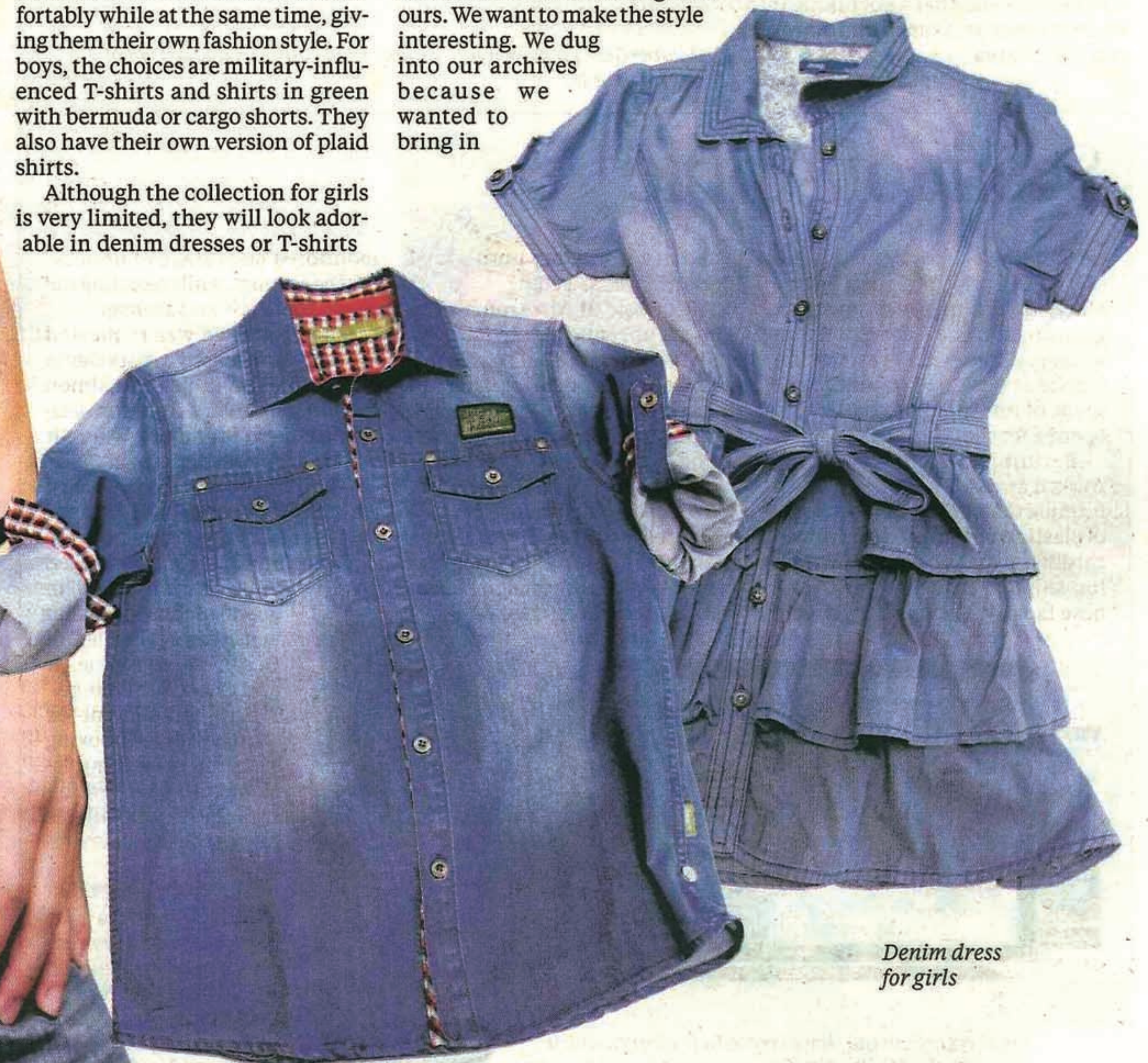
Denim shirt for boys